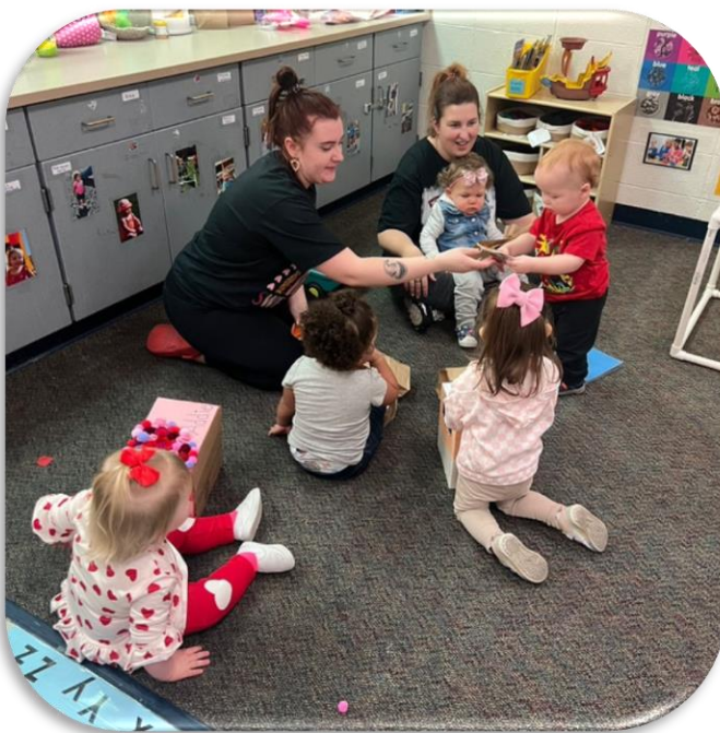
"Infant/Toddler friends passing out their Valentine's!"

What we are working on: We have been working hard on sign language this year. We have added sign language to our group time and use it in everyday activities and conversations. We highly suggest parents to use sign language at home with your child as it is a wonderful tool to help encourage language development and facilitates communication between adults and children. We are working on the words "more," "please," "all done," "thank you," and "sorry." We have posted the signs in the classroom if you want to follow along!