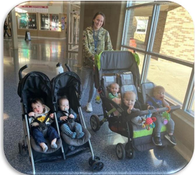
"Babies enjoying a morning stroll!"

Our friends are going to work on using utensils at mealtime, and along with that we will work with the older ones to get up from the table on their own when they are all done. Our older friends will also work on signing "all done" when they are ready to get up from the table. Our younger friends and older friends will work on their gross motor skills like, tummy time, rolling over, sitting up, pulling themselves up, standing, and walking.