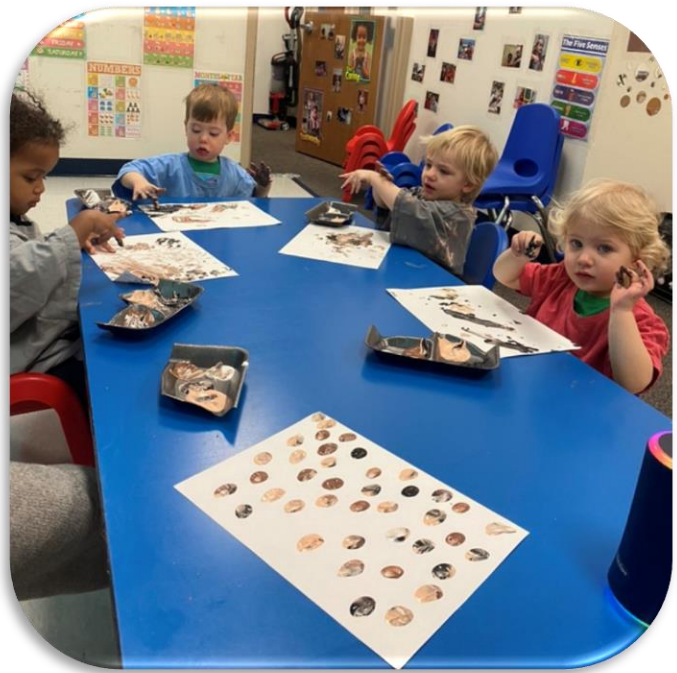
"Toddler friends learning about diversity while fingerpainting!"

Early Learning Guidelines Goals: This month we will be working on using descriptive words to make observations and describe objects and actions in the environment as well as doing simple tasks to reach an outcome. (S. 02) Develops foundational skills in learning and understanding about the world through explanation and investigation.