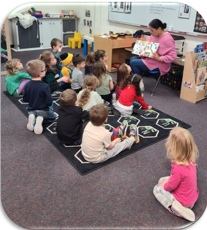
"Preschool friends enjoyed a story from a guest visitor!"

ELG Learning Objectives: We are working on staying together as a group while walking through the building. (LL.02) Develops foundational skills to communicate effectively for a variety of purposes. Children will share personal experiences during group time and while interacting in centers.