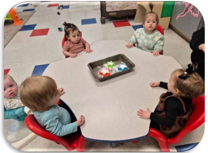
"Babies enjoyed a shape inspired science experiment!"

This month is all about working on our fine motor skills! We will be working on stacking up our rubber blocks, nesting cups, and small buckets. Our older friends will be working on moving toys from one hand to another. Our younger friends will be working on tracking objects with their eyes and reaching out to grab the object.