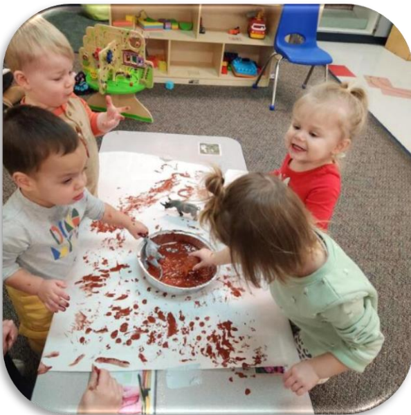
"Infant/Toddler friends making Animal Tracks using paint and toy animals!"

What we are working on: ELG Learning Objectives: CA. 01 Develop foundational skills to support creative expression through voice, instruments, and objects.