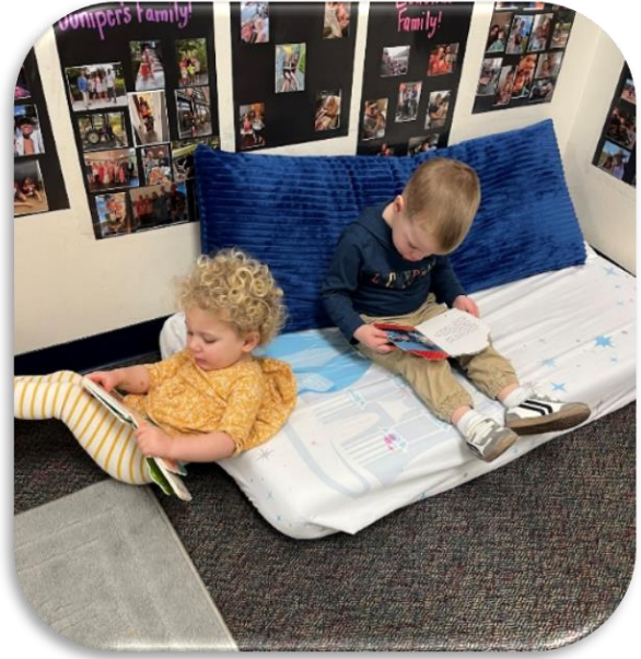
"Toddlers enjoying their new cozy corner!"

Have you asked your toddler about their favorite color? This toddler class has done extremely well learning colors (some can even sign them!). The next learning activity will be learning to identify letters in our names!