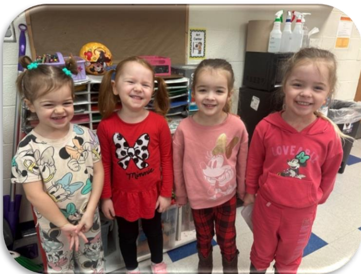
"Minnie Mouse Club!"

What we are working on: Our younger preschoolers are working on learning our letters, numbers, shapes, and colors. We are also mastering our self-help skills by getting more independent with dressing in our winter gear and handwashing. Older Preschoolers are working on manners and independent skills that will get them ready for kindergarten.